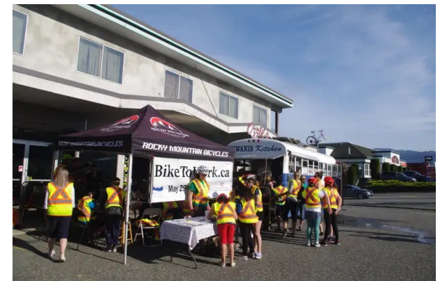
Go By Bike for Everyone! Join us for Fall, Winter and Spring events!