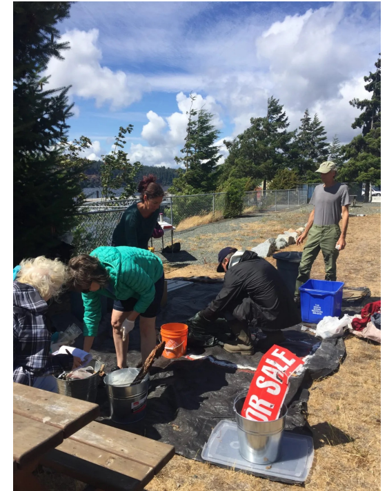
Sorting out the clean up with Ocean Friendly Port Alberni!